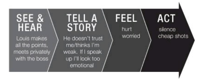
Figure 6-3. Maria's Path to Action

Of course, as we come up with our own meaning or stories, it isn't long until our body responds with strong feelings or emotions—after all, our emotions are directly linked to our judgments of right/wrong, good/bad, kind/selfish, fair/unfair, etc. Maria's story yields anger and frustration. These feelings, in turn, drive Maria to her actions—toggling back and forth between clamming up and taking an occasional cheap shot (see Figure 6-3).