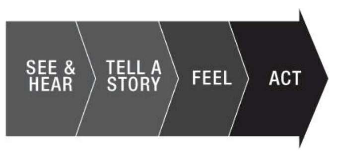
Figure 6-2. The Path to Action

You'll note that we've added telling a story to our model. We observe, we tell a story, and then we feel. Although this addition complicates the model a bit, it also gives us hope. Since we and only we are telling the story, we can take back control of our own emotions by telling a different story. We now have a point of leverage or control. If we can find a way to control the stories we tell, by rethinking or retelling them, we can master our emotions and, therefore, master our crucial conversations.